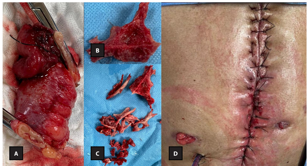
Figure 3. A. Small intestine segment. B and C. Bone fragments. D. Abdominal cavity closure

After 75 days of intrahospital stay, the culture of the abdominal cavity was reported positive for Morganella morganii spp; for this reason, treatment was started