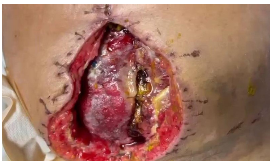
Figure 2. Frozen abdomen, Björk 4