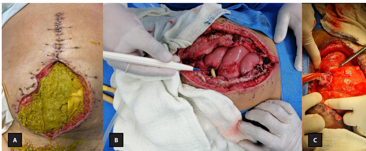
Figure 1. A. Leakage of intestinal material. It is evident when removing the retention stitches, opening of the abdominal cavity with leakage of intestinal material and dehiscence of the aponeurosis. B. Fistula splinting with Foley catheter. C. Rivera´s condom technique