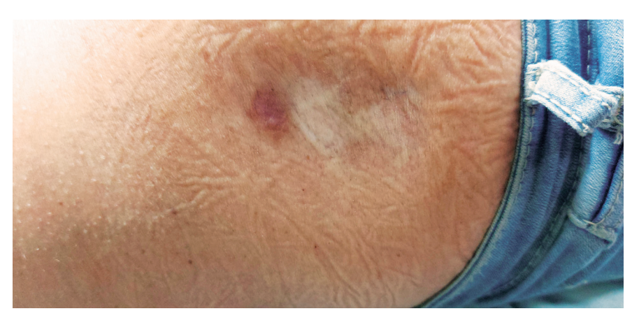
Figura 3. Lesión ligeramente deprimida, con disminución notable de área de piel acrómica