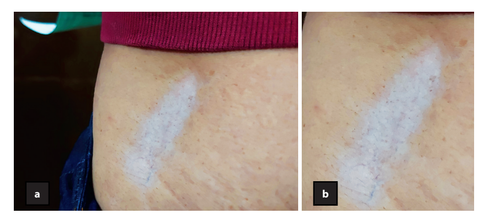
Figura 1. Lesión atrófica, ovalada, de bordes netos en acantilado. a. Presencia de área de piel acrómica en su interior, blanda a la palpación y asintomática. b. Mayor aumento

One month after the end of the treatment, the satisfactory therapeutic results remained stable (absence of atrophy), with a slight residual hypercromia in the treated area.